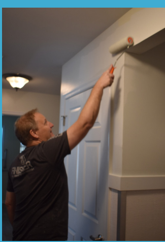
TK Promotions volunteers painted the Tate house in Ashland.