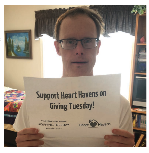
Black Friday. Cyber Monday.

Giving Tuesday is a global day of giving, fueled by the power of social media. This year, gifts to Heart Havens on Giving Tuesday will be matched and donors will be entered into a drawing. You can participate by giving through any of Heart Havens' donation options.