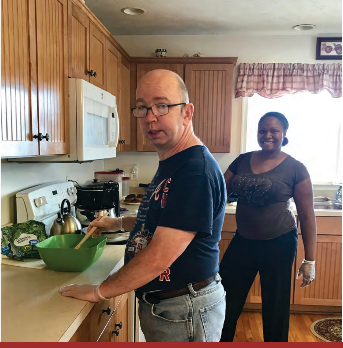
In our staff's words:

Heart Havens staff recognize each individual's strengths, one person at a time, one day at a time and one goal at a time. Each of us contributes to bring smiles in the lives of those we support and it transforms them.